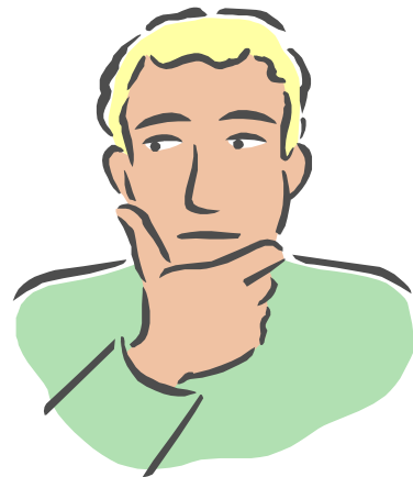
By Cougan Collins